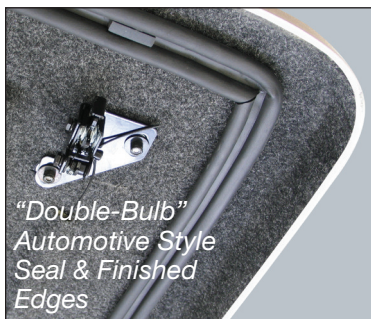
"Double-Bulb" Automotive Style Seal & Finished Edges