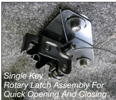
Single Key Rotary Latch Assembly For Quick Opening And Closing