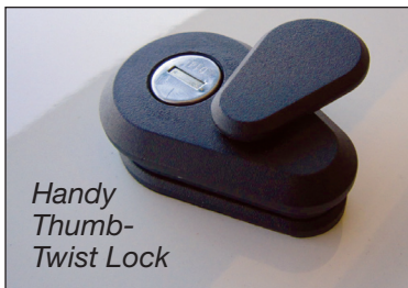
Handy Thumb- Twist Lock