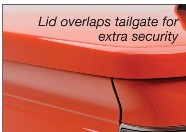
Lid overlaps tailgate for extra security