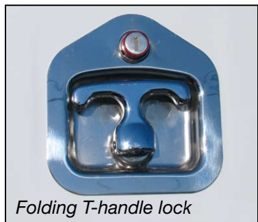
Folding T-handle lock