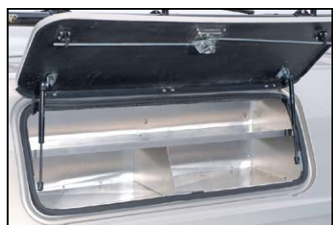
Side door and shelving options