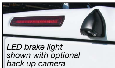
LED brake light shown with optional back up camera