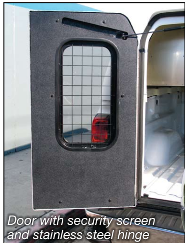
Door with security screen and stainless steel hinge